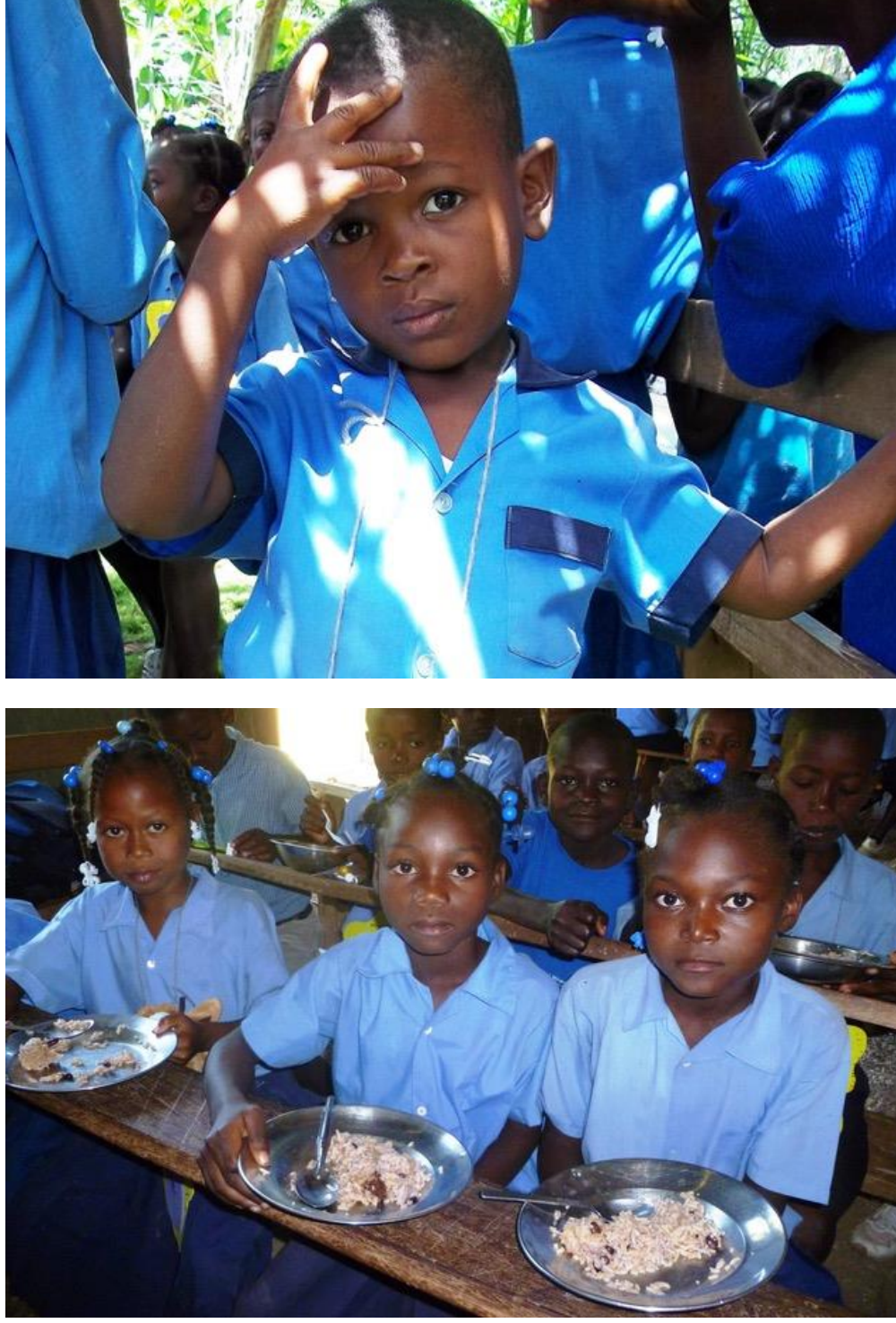
These meals make a difference

If you would like to make an extra donation to our very underpaid teachers so that they can be sure to feed their families it would be greatly appreciated.Please make all checks to MISSION HAITI and write JEREMIE TEACHERS on memo line to make sure your donation is sent to the proper project.