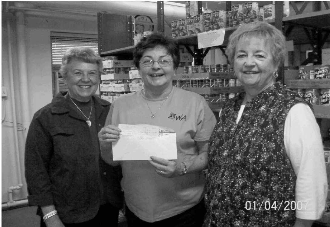
Our Thrivent Reps presenting the check for the Seminary Food bank, from the Bake Sale & Thrivent's Matching Funds. (Date on picture is inaccurate.)